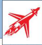
Pandora - Gilboa